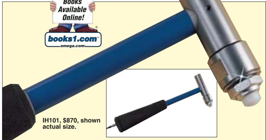
IH101, $870, shown actual size.

5 s (IH101-10), 20 s (IH101-50), 50 s (IH101-100), 170 s (IH101-500), 300 s (IH101-1K)