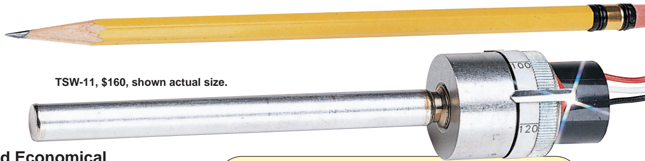
TSW-11, $160, shown actual size.