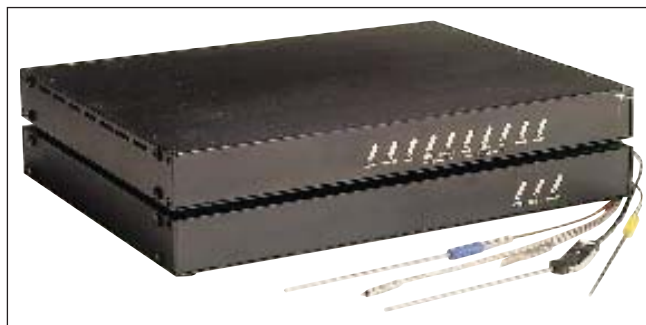
The OMB-TEMPSCAN Temperature Measurement System

Lastly, there are two types of communication-based systems: ones that can stand alone for a period of time, and those that must be in constant communication with a host in order to operate. This difference is profound. Are you willing to dedicate a computer/terminal for communications with the system when it is operational, or do you want the system to perform the acquisition and control without the use of a host, and have the system "dump" the information to the host at a later time, when you can analyze it? A stand-alone system offers you enhanced programmability, and has storage