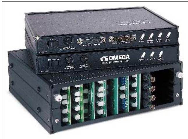
The OMB-DAQBOOK Portable System

There are a number of factors to consider when selecting a front-end system. Begin by analyzing your requirements; do you need only analog inputs, or analog outputs and digital I/O? How many inputs and outputs will you need? Pricing is also a very important factor, in that different systems have different initial costs, with various upgrade/enhancement prices. One major consideration in choosing the right system in the future: if you can anticipate your future needs and requirements, make sure that the system you select either has them now, or can be easily upgraded with them later.