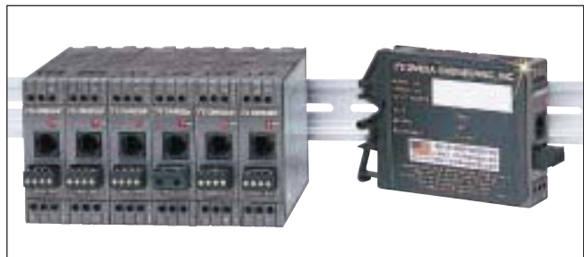
The DRX Series Distributed Modules

capacity for both the program and the data which enables it to perform its functions. The trade-off for these capabilities, however, is price. More enhanced systems, with added features, are more expensive.