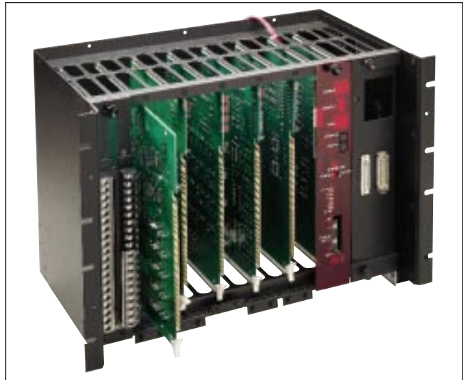
The Workhorse Modular System

capacity for both the program and the data which enables it to perform its functions. The trade-off for these capabilities, however, is price. More enhanced systems, with added features, are more expensive.