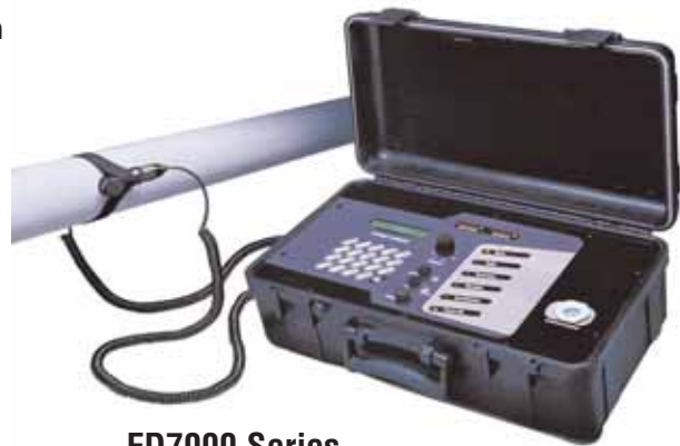
FD7000 Series Ultrasonic Flowmeter

In applications containing insufficient particle or bubble reflectors for conventional Doppler measurement, the FD-7000's mating-flow transducers should be mounted on the pipe at a point where non-symmetrical hydraulic turbulence exists, the best position being one to three pipe diameters downstream from a 90^{\circ} elbow. A digital filtering system and signal recognition circuitry transform the turbulence reflections to linear data. Operating in this mode, the FD-7000 is one of the few flowmeters that do not require a straight upstream pipe run.