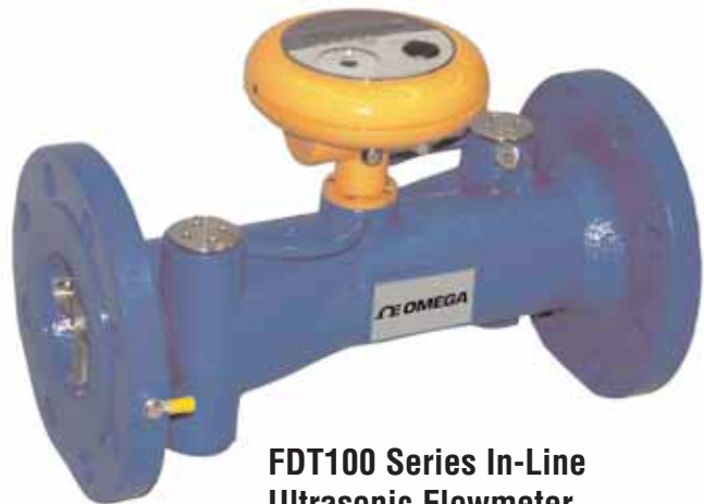
FDT100 Series In-Line Ultrasonic Flowmeter

Transit-time flowmeters come in single-path and multi-path designs, the former using one transducer pair to measure a small section of fairly uniform flow; the latter using multiple pairs to measure non-uniform flow along a length of large-diameter pipe or conduit of the type commonly found in utility applications. Multi-path designs are used in raw wastewater and storm water applications, and to measure stack gas flows in power plant scrubbers.