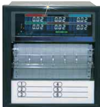
RD206, £1045, shown smaller than actual size, see page S-23.