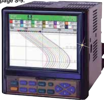
RD9912, £2145, shown smaller than actual size, see page S-9.

* Note: Universal inputs are programmable for T/C, RTD, mV, V.