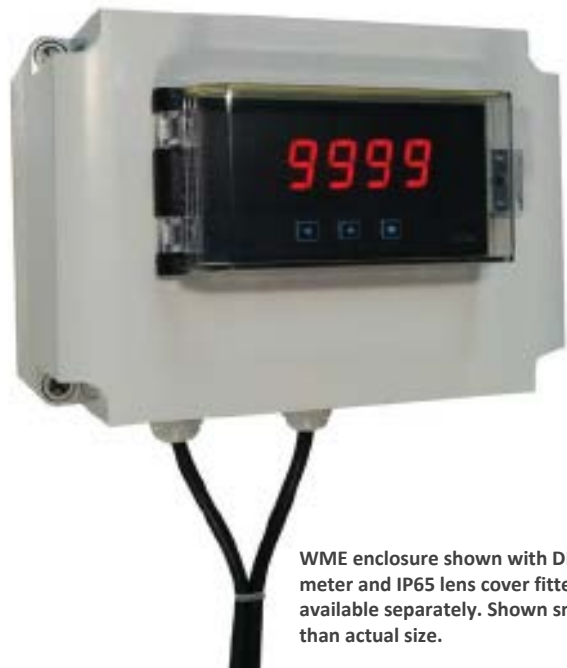
WME enclosure shown with DP20 meter and IP65 lens cover fitted, both available separately. Shown smaller than actual size.

Wall mount housing for 1/8 DIN panel meters (96 x 48 mm)